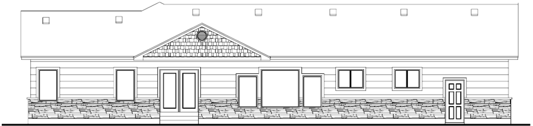
R-2026-12CE Rear Elevation