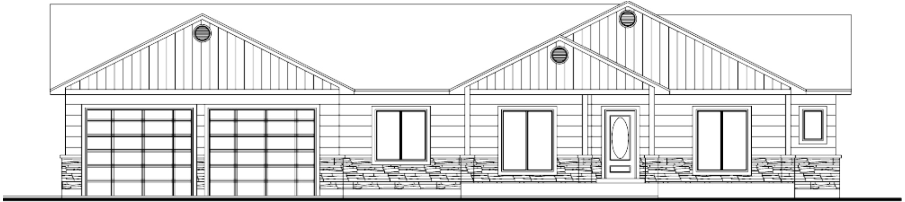
R-2026-12CE Front Elevation